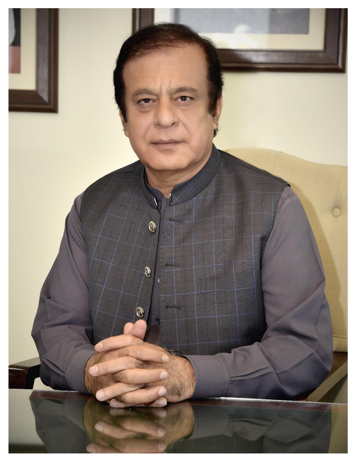
Senator Shibli Faraz, Federal Minister for Science & Technology